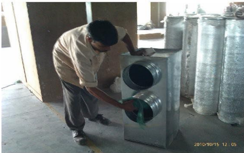
Equipment covered during Construction Phase