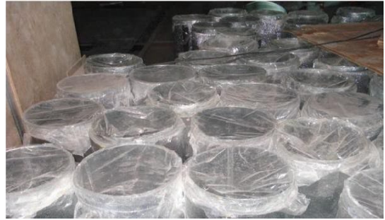
Ducts Stored with Properly Wrapped with Plastic