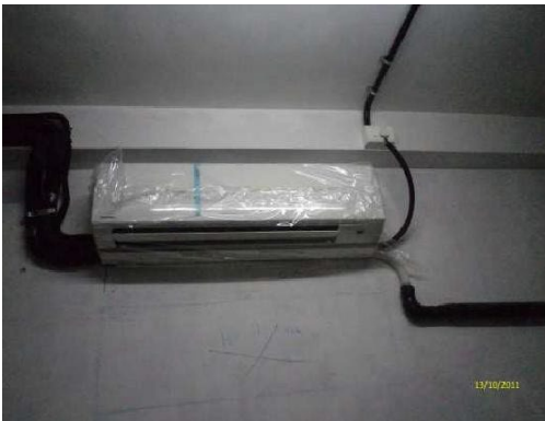
Equipment covered during Construction Phase