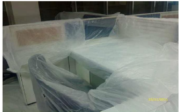
Equipment covered during Construction