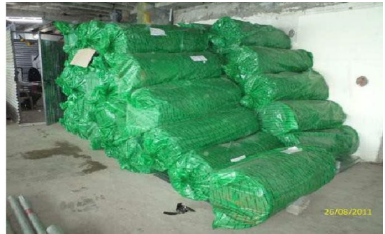
Equipment covered during Construction