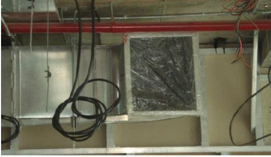
Ducts Wrapped With Plastic To Avoid Dust