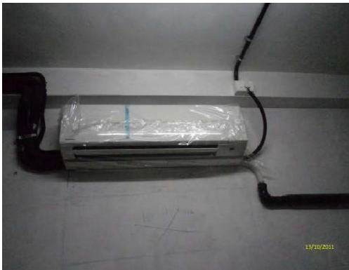
Equipment covered during Construction