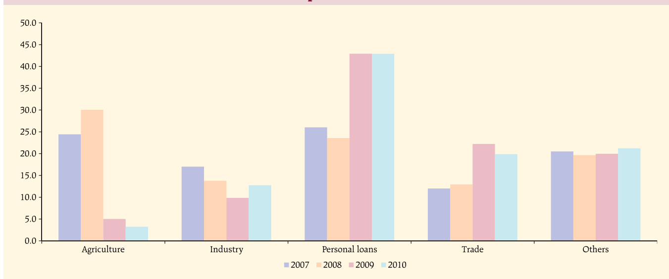
Chart 3: Occupational Share in Credit

personal loans, followed by advances to trade and industry (Chart 3).